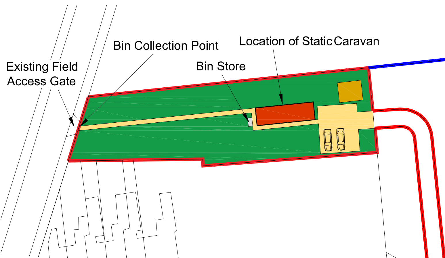
Proposed Site Plan @ Scale 1:500